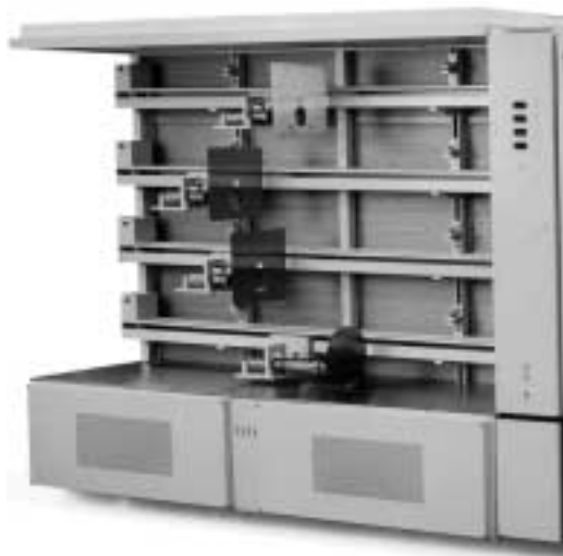
Class 10-compatible load station