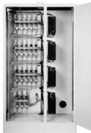
Rear tube-pull source cabinet with vertical gas panels