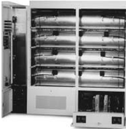
PRO 150 4-stack furnace